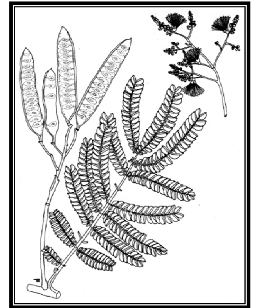
( Falcataria moluccana ; synonyms Albizia falcataria , Paraserianthes falcataria ) Twig with fruits (above), flowers (upper right)